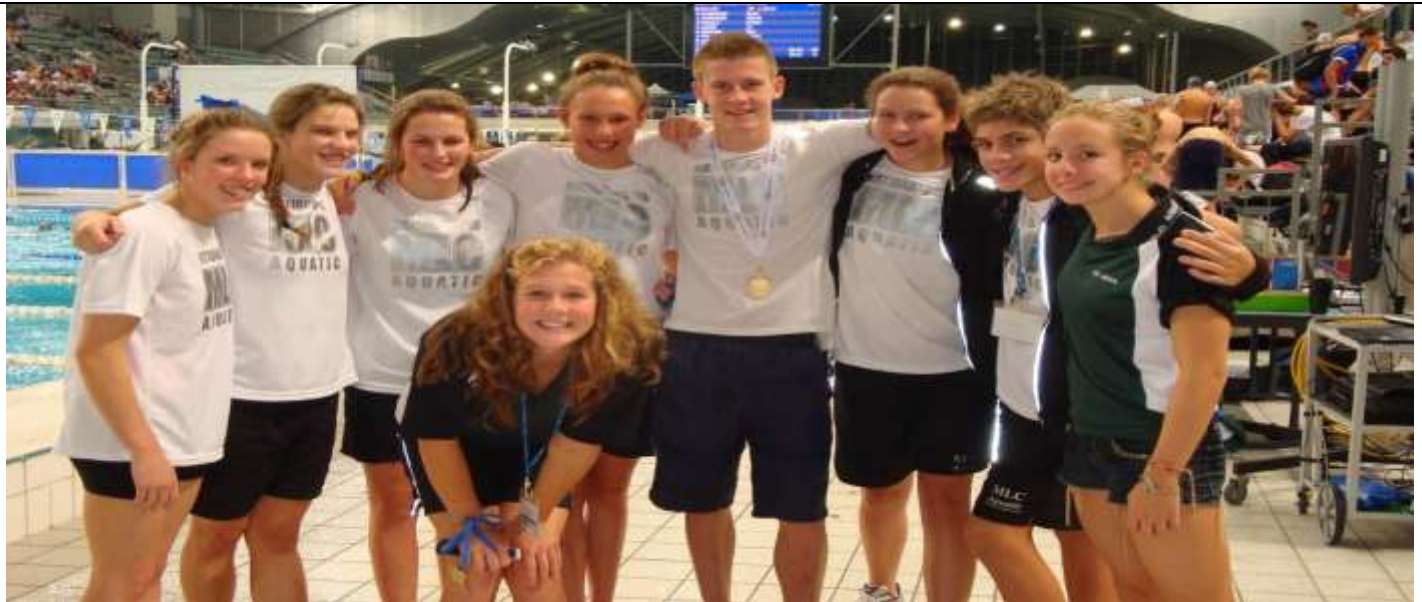
Final Night of Comp – MLC Team Hug's. with THAT GOLD MEDAL!!